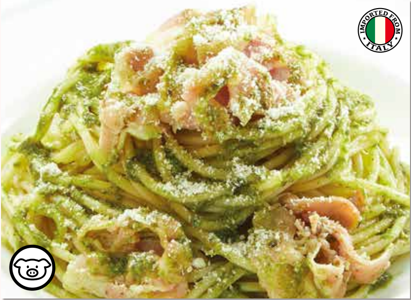
PESTO GENOVESE 意式青酱培根意大利面 Flavourful Pesto Sauce with Bacon and Cheese $790 nett