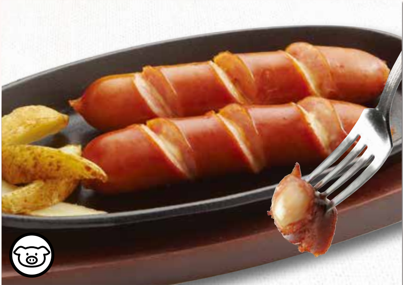
BEDDAR CHEDDAR SAUSAGE 芝士香肠 Pork Sausage stuffed with chunks of Cheddar Cheese