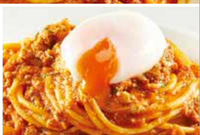
BOLOGNESE POACHED EGG 肉酱意大利面(加半生熟蛋) With Beef Bolognese Sauce and Poached Egg