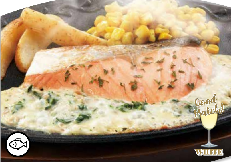
GRILLED SALMON 烤三文鱼 Grilled Salmon with Cream Sauce & Spinach