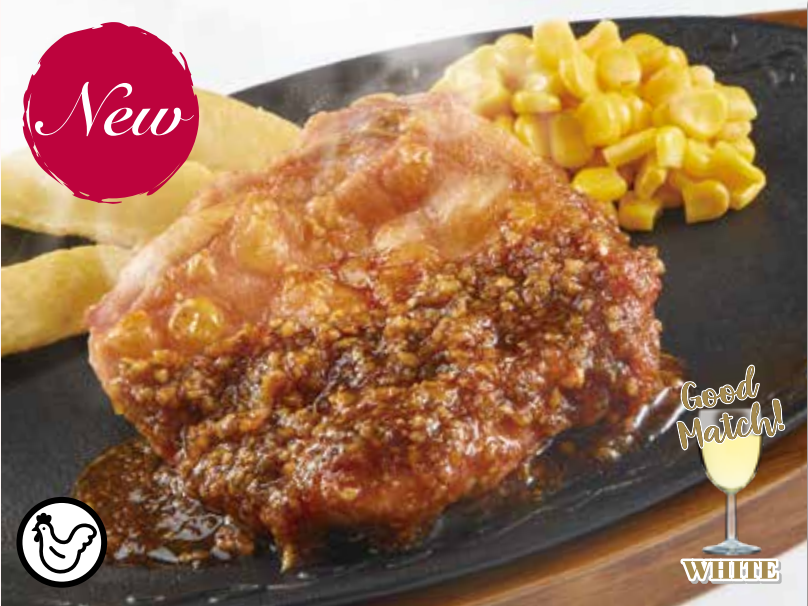
LIME GARLIC CHICKEN 青柠香蒜鸡排 Chicken with Lime Garlic Sauce