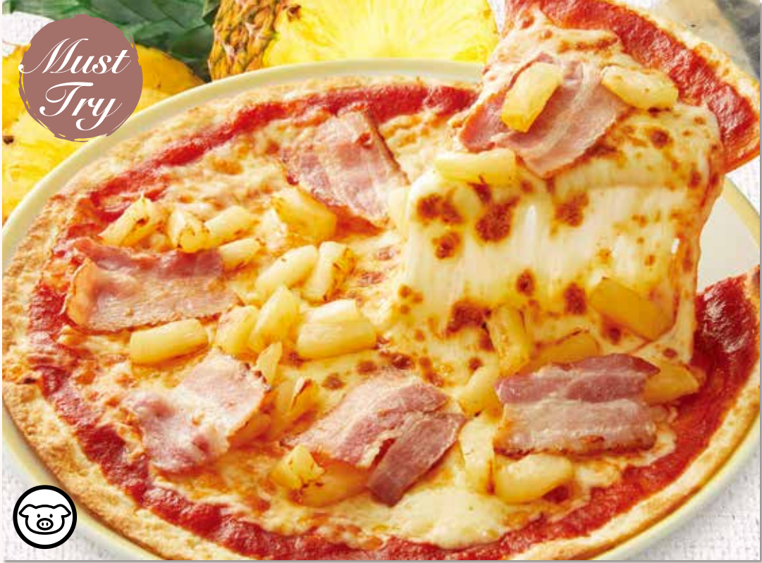
PINEAPPLE & BACON 黄梨培根披萨 Bacon and Pineapple with Mixed Cheese