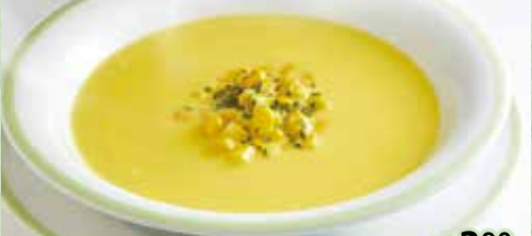
CORN CREAM SOUP s$2 90 nett