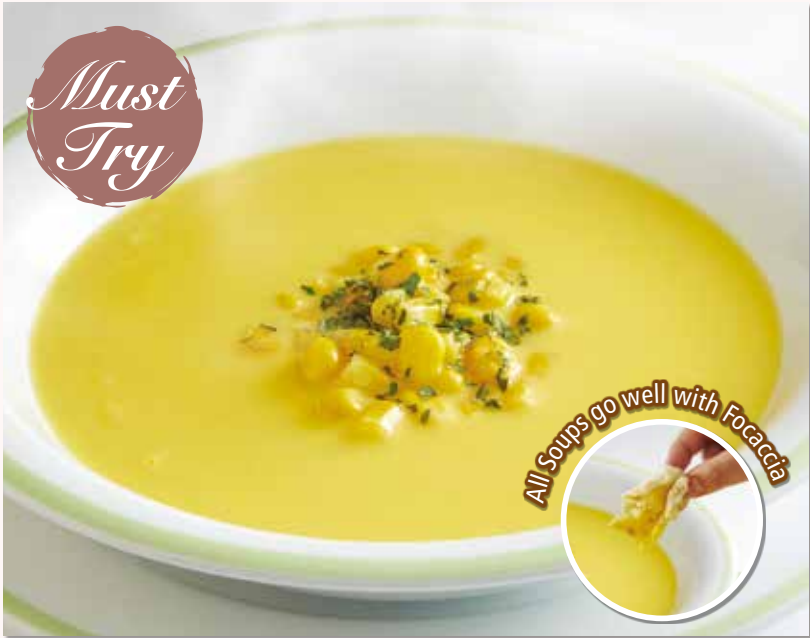
CORN CREAM SOUP 玉米奶油浓汤 Creamy Soup made with Corn