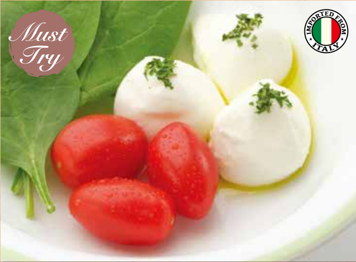
BUFFALO MOZZARELLA CHEESE 水牛芝士小番茄 Italian Mozzarella Cheese with Tomato and Baby Spinach