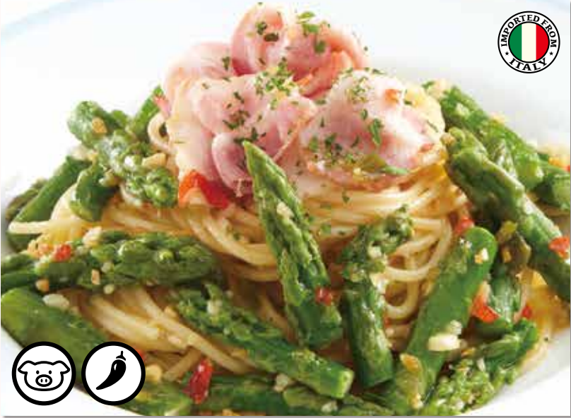
AGLIO OLIO ASPARAGUS & BACON 芦笋培根香蒜意大利面 Peperoncino Sauce with Asparagus & Bacon $790 nett