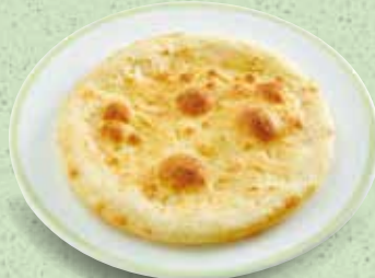
ORIGINAL FOCACCIA s$200 nett