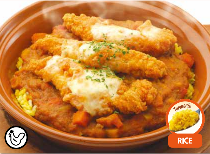
CURRY CHICKEN BAKED RICE 香脆鸡柳咖喱焗饭 Rice With Crispy Chicken In Vegetable Curry Sauce