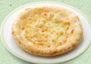
CHEESY FOCACCIA s$250 nett