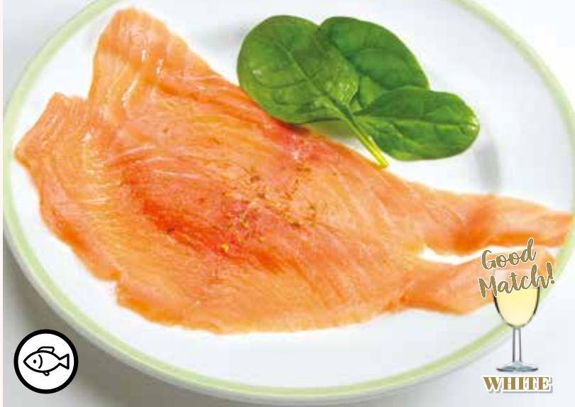
SMOKED SALMON 烟熏三文鱼 Smoked Salmon