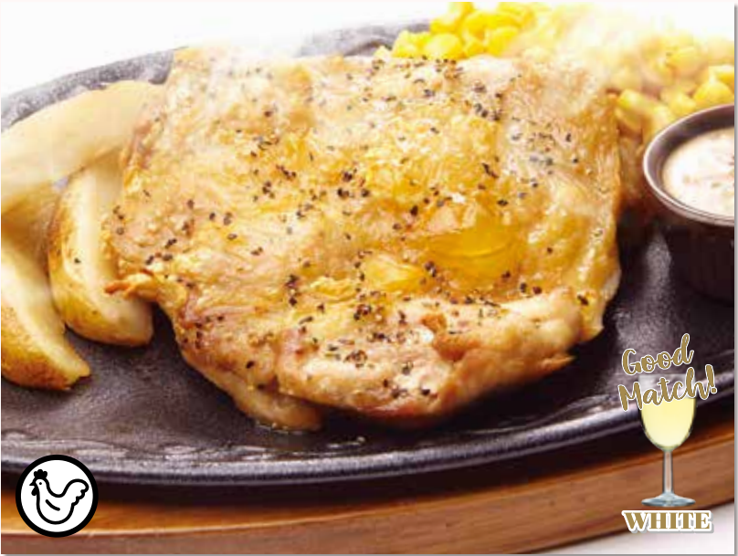
PEPPER CHICKEN 黑胡椒鸡排 Chicken with Black Pepper Sauce