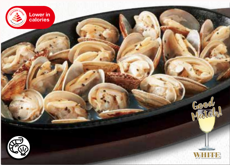
BAKED CLAMS 清香烤蛤蜊 Clam with Black Pepper