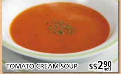
TOMATO CREAM SOUP s$290 nett