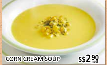
CORN CREAM SOUP s$290 nett