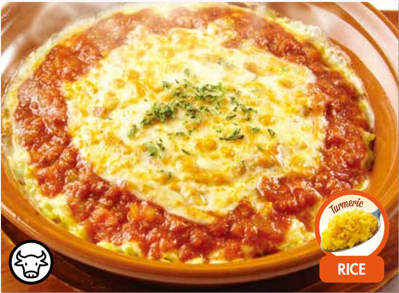
CHEESE MILANO DORIA 芝士米兰风味肉酱奶汁焗饭 Rice in Beef Bolognese Sauce & White Sauce with Cheese