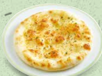
GARLIC FOCACCIA s$230 nett