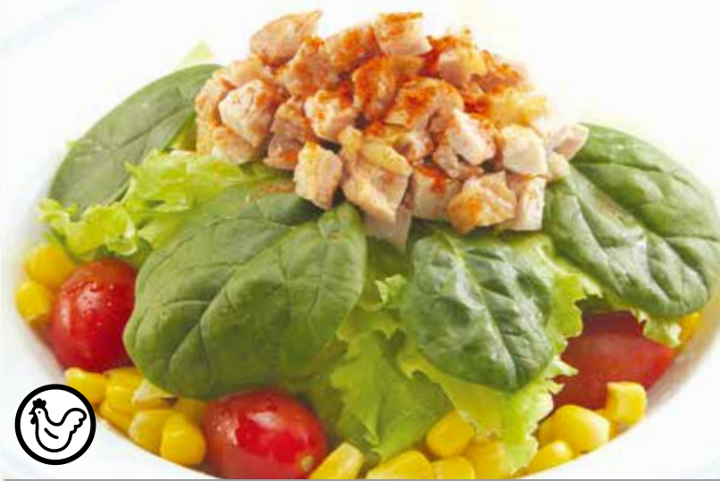
CHICKEN SALAD 鸡肉沙拉 Grill Chicken