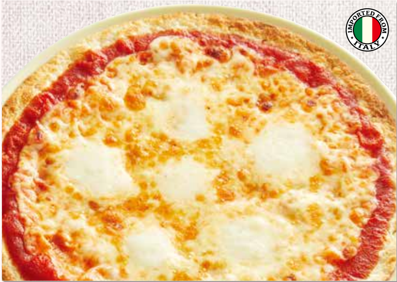
MARGHERITA 玛格丽塔披萨 Italian Buffalo Mozzarella Cheese