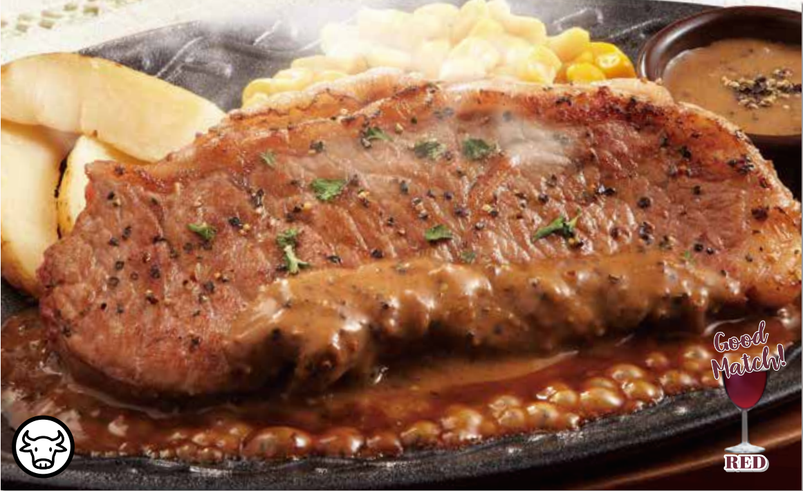
SIRLOIN STEAK 西冷牛排 Beef Steak with Black Pepper Sauce