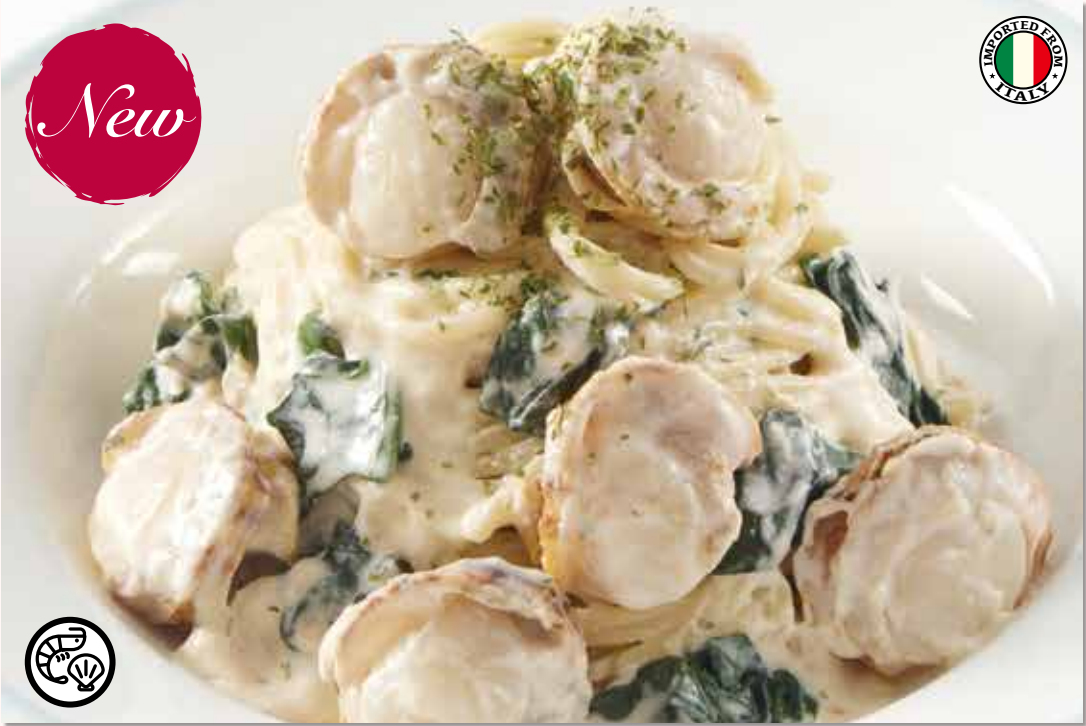
CREAM SCALLOP & SPINACH 扇贝菠菜意大利面 Cream sauce with Scallop & Spinach $790 nett