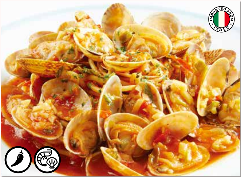
VONGOLE SPICY TOMATO 蛤蜊香辣番茄意大利面 Spicy Tomato Sauce with Clam $590 nett