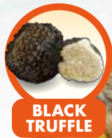
BLACK TRUFFLE & MUSHROOM 黑松露蘑菇意大利面 Black Truffle Cream Sauce with Mushroom