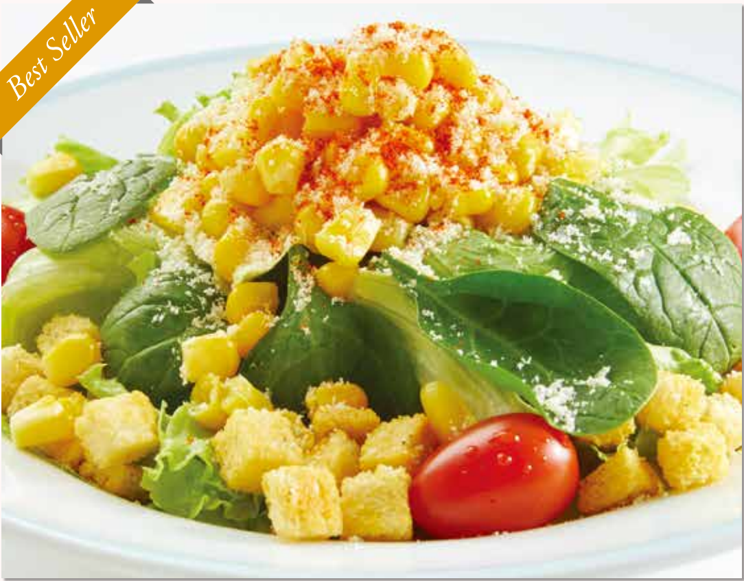
CHEF SALAD 主厨沙拉 Parmesan Cheese, Crouton