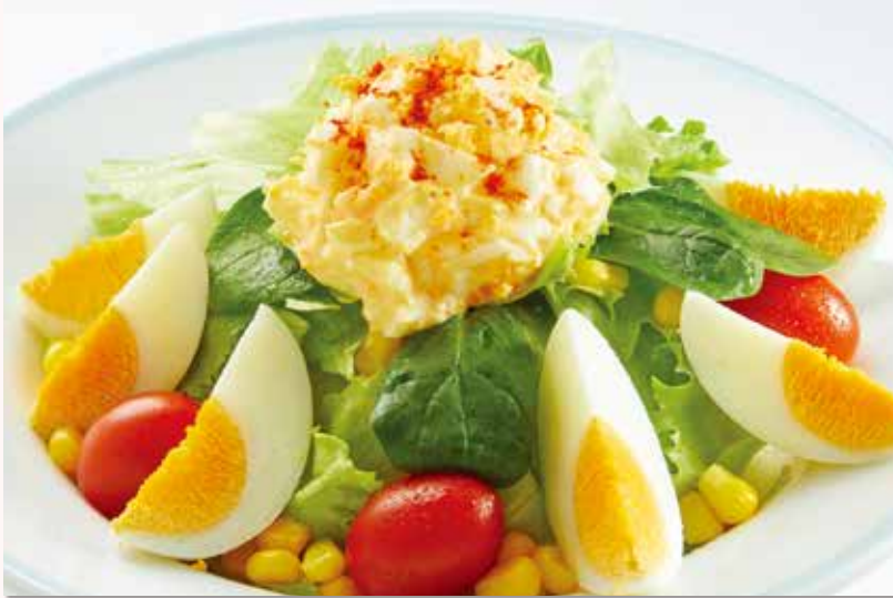
EGG SALAD 鸡蛋美乃滋沙拉 Egg, Mayonnaise