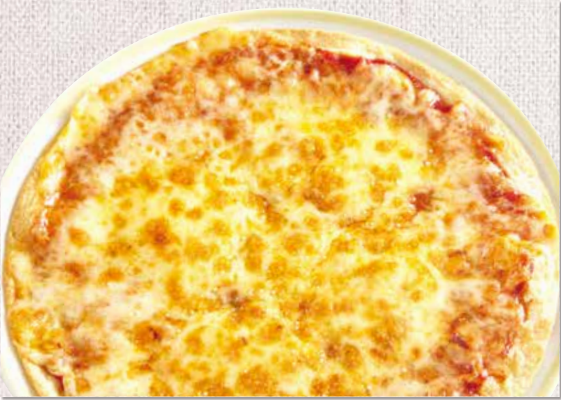
DOUBLE CHEESE 双重芝士披萨 Double the Amount of Mixed Cheese (x2 Cheese Option Not Applicable)