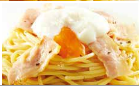
CARBONARA POACHED EGG 奶酪培根意大利面(加半生熟蛋) Egg Sauce with Bacon and Poached Egg