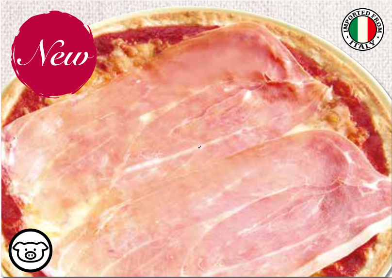
PARMA HAM (PROSCIUTTO) 帕尔玛火腿披萨 Italian Parma Ham with Mixed Cheese