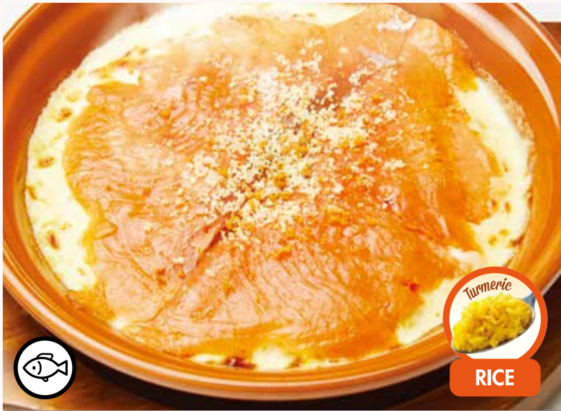
SALMON DORIA 三文鱼奶汁焗饭 Rice with Smoked Salmon in White Sauce