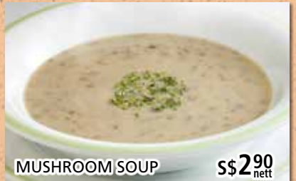
MUSHROOM SOUP s$290 nett