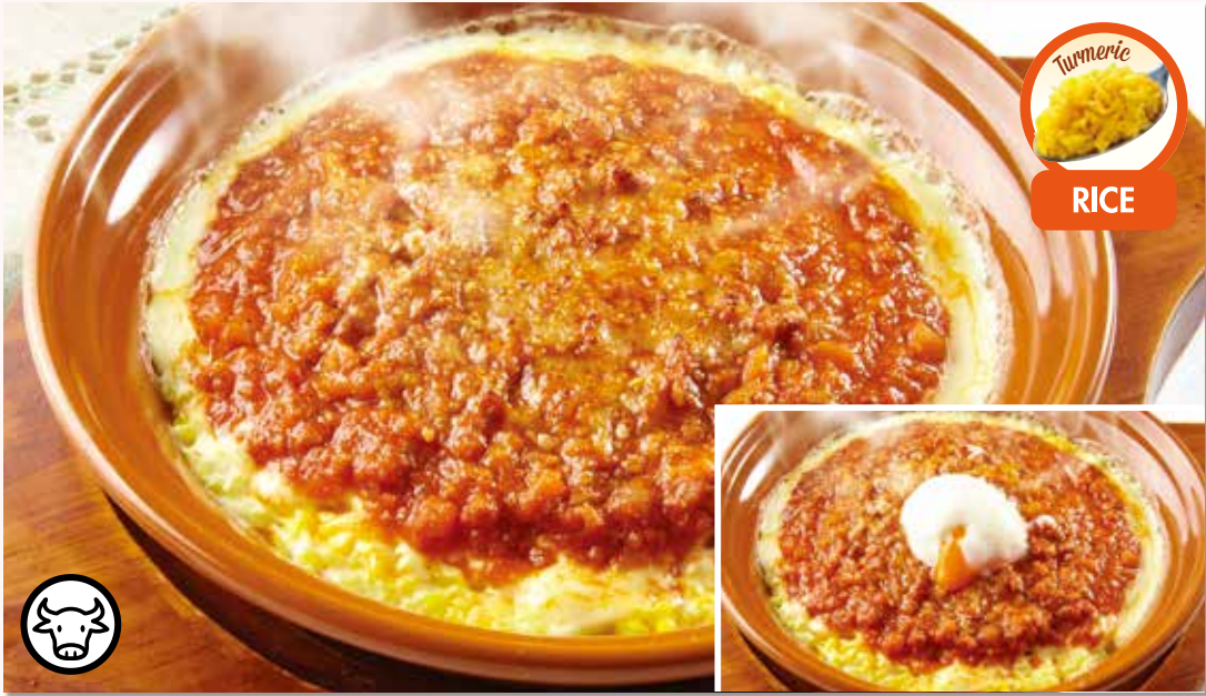
MILANO DORIA 米兰风味肉酱奶汁焗饭 Rice in Beef Bolognese Sauce & White Sauce