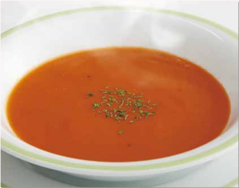
TOMATO CREAM SOUP 番茄奶油浓汤 Creamy Soup made with Tomato