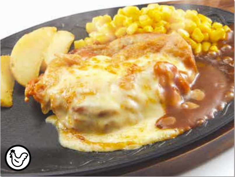
CHEESE CHICKEN 芝士鸡排 Chicken with Mixed Cheese