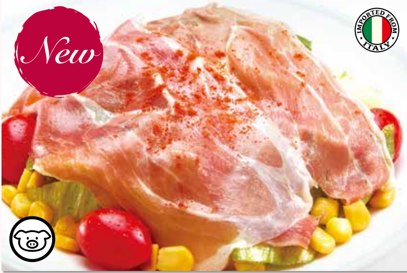
PARMA HAM (PROSCIUTTO) SALAD 帕尔玛火腿沙拉 Italian Parma Ham

Kindly inform attendants if you prefer the dressing to be served separately