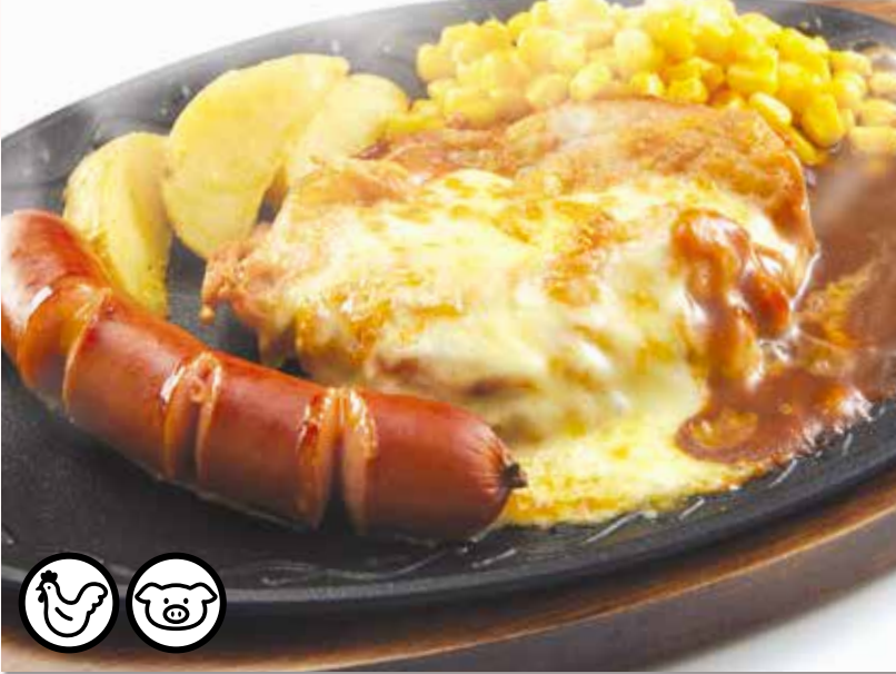
CHEESE CHICKEN & SAUSAGE 芝士鸡排加芝士香肠 Chicken with Mixed Cheese and Pork Cheddar Sausage