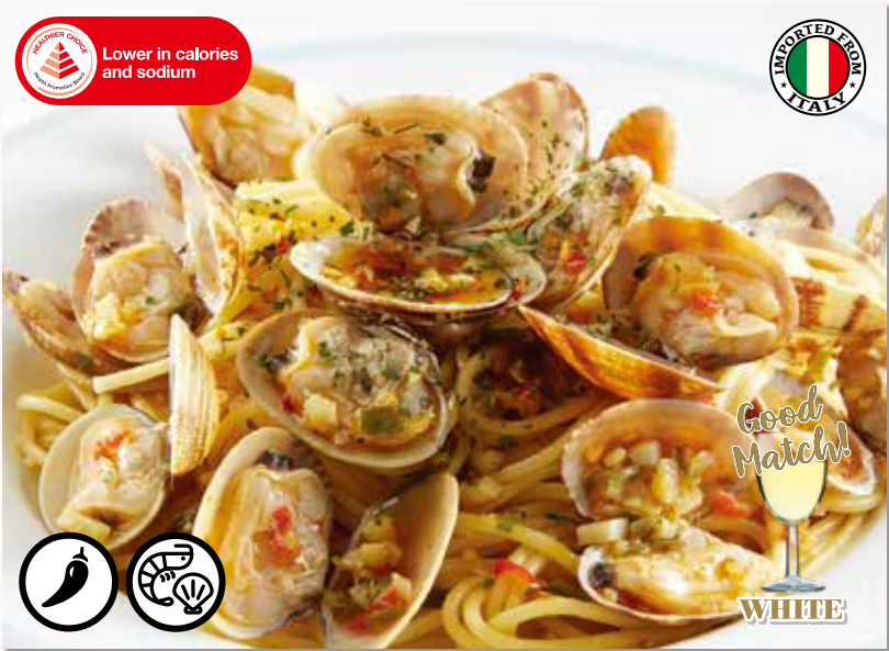
AGLIO OLIO VONGOLE 蛤蜊香蒜意大利面 Peperoncino Sauce with Clam $590 nett