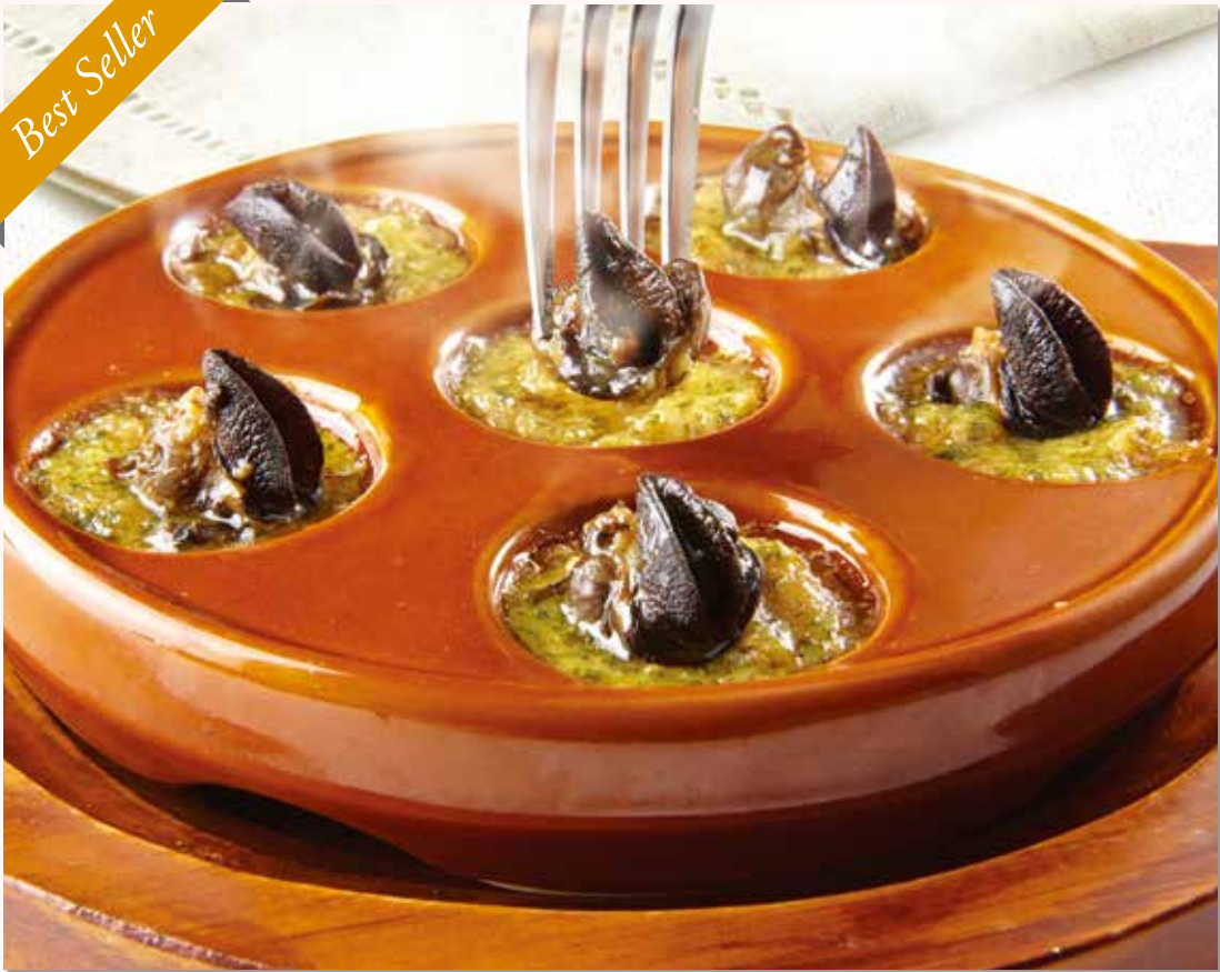
OVEN GRILLED ESCARGOTS 香蒜蜗牛 Escargots Garlic Butter with Mixed Vegetables