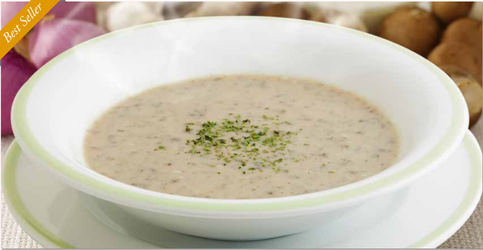
MUSHROOM SOUP 蘑菇奶油浓汤 Creamy Soup made with Button Mushroom