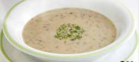
MUSHROOM SOUP s$2 90 nett