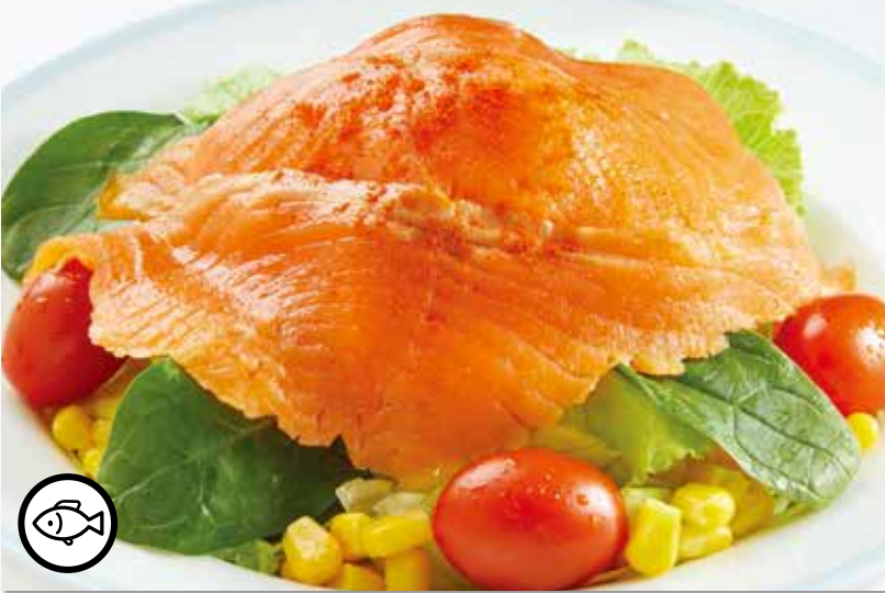
SALMON SALAD 三文鱼沙拉 Smoked Salmon