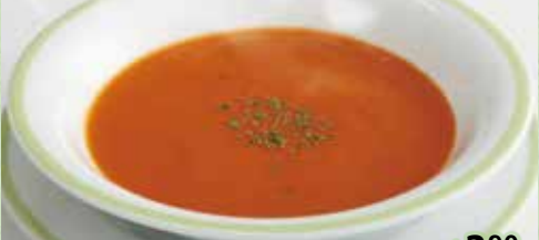
TOMATO CREAM SOUP s$2 90 nett