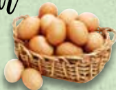
POACHED EGG (Cold) 半生熟蛋