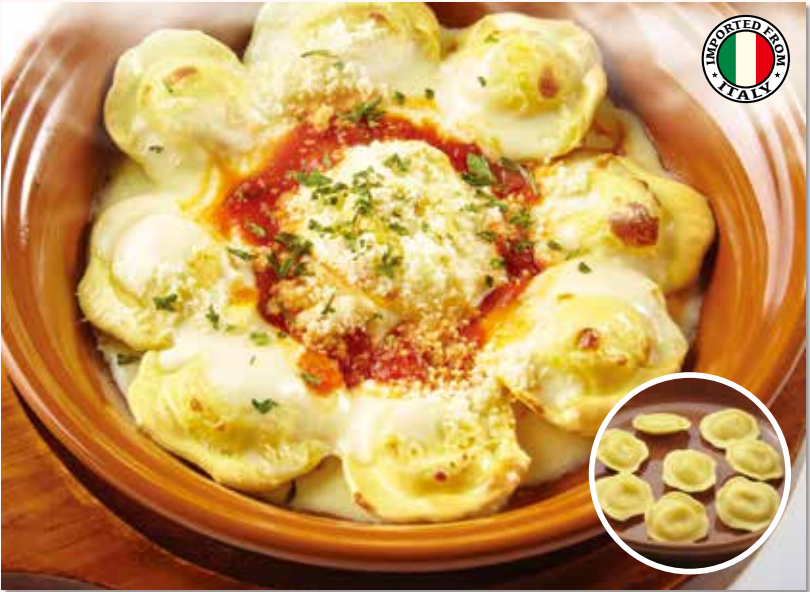
FOUR CHEESE RAVIOLI 四重芝士意大利饺 Traditional Italian Pasta filled with Ricotta, Edam, Gorgonzola & Emmental Cheese