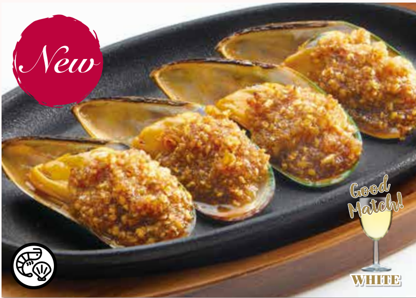
GRILL GREEN MUSSEL WITH LIME GARLIC 青柠香蒜焗烤贻贝 Half Shell Green Mussel with Lime Garlic Sauce