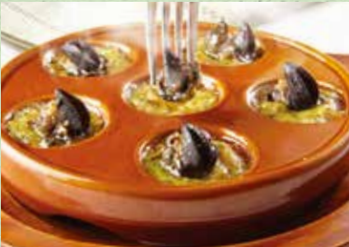
OVEN GRILLED ESCARGOTS