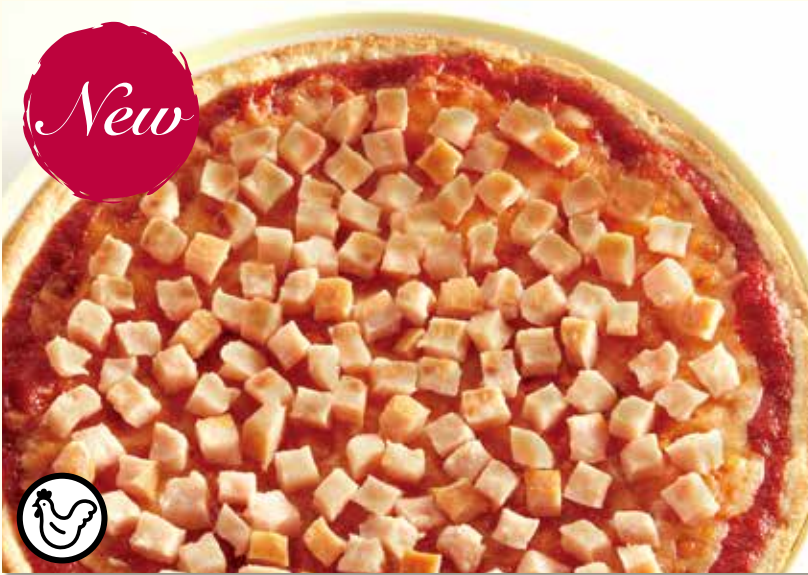
CHICKEN HAM 鸡肉火腿披萨 Chicken Ham Cube with Mixed Cheese