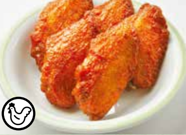
CHICKEN WING 5pcs