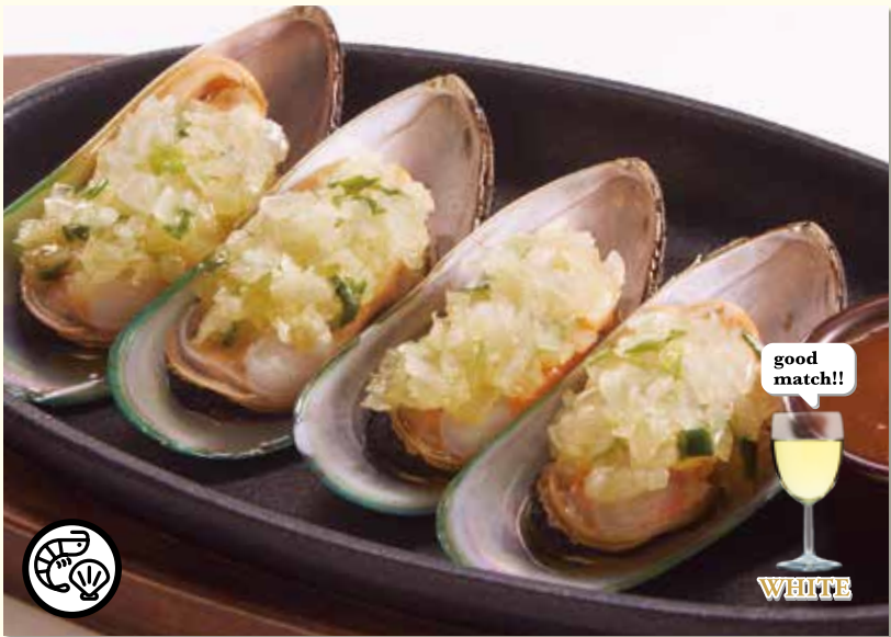
GRILL GREEN MUSSEL 焗烤贻贝 Half Shell Green Mussel with Vegetable Salsa & Demi Sauce