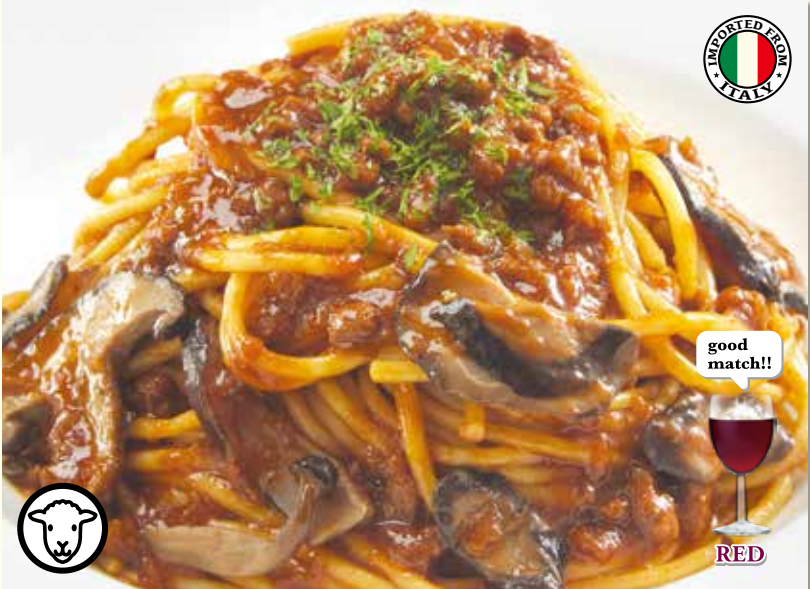
LAMB RAGU & MUSHROOM 羊肉酱蘑菇意大利面 Meaty Lamb Ragu sauce with Mushroom