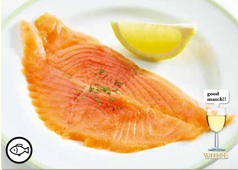
SMOKED SALMON 烟熏三文鱼 Smoked Salmon