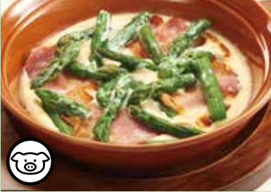
CREAM ASPARAGUS WITH BACON