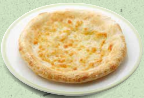
CHEESY FOCACCIA 芝士披萨包