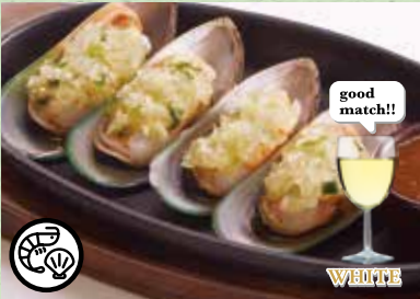
GRILL GREEN MUSSEL