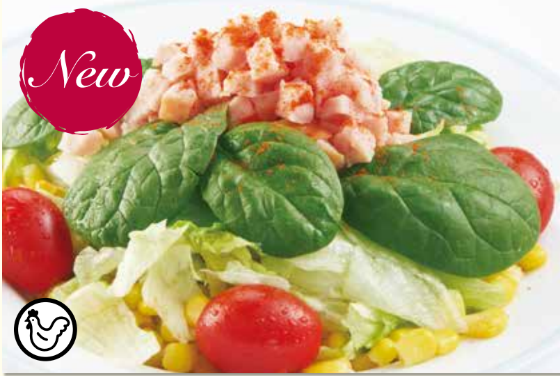
CHICKEN HAM SALAD 鸡肉火腿沙拉 Chicken Ham

Kindly inform attendants if you prefer the dressing to be served separately