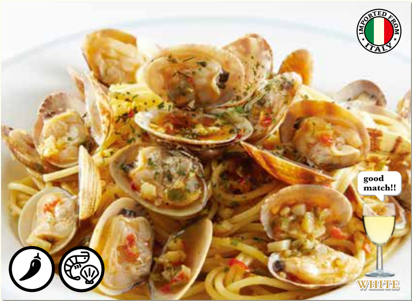
AGLIO OLIO VONGOLE 蛤蜊香蒜意大利面 Peperoncino Sauce with Clam