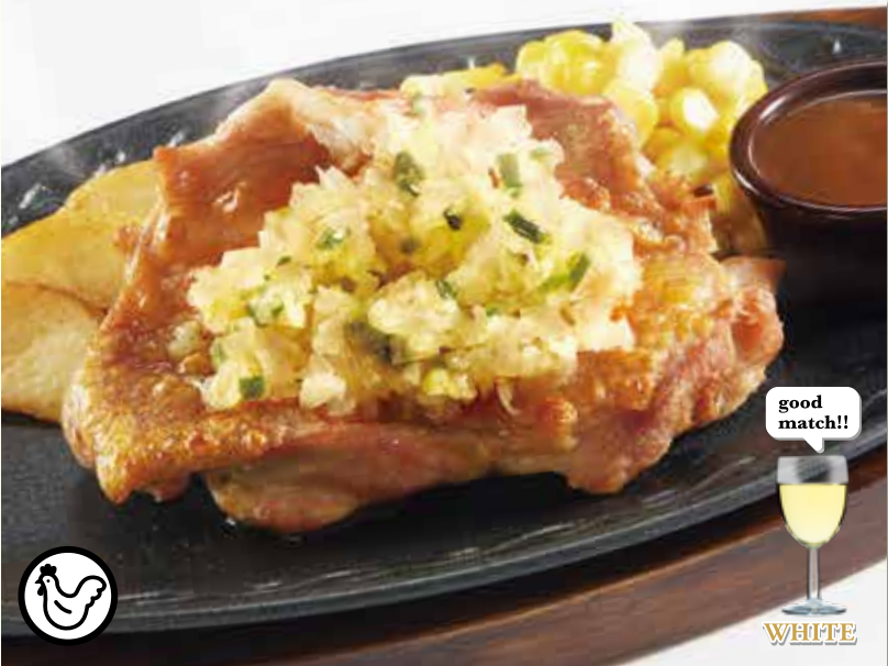
CHICKEN VEGETABLE SALSA 洋葱蒜香鸡排 Chicken with Vegetable Salsa & Demi Sauce