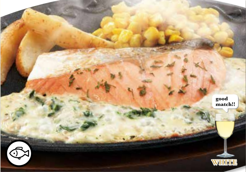
GRILLED SALMON 烤三文鱼 Grilled Salmon with Cream Sauce & Spinach