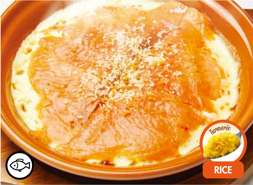
SALMON DORIA 三文鱼奶汁焗饭 Rice with Smoked Salmon in White Sauce