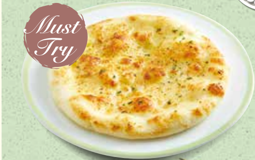
GARLIC FOCACCIA 香蒜披萨包