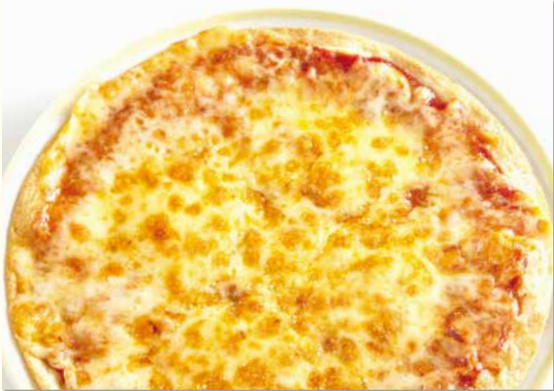
DOUBLE CHEESE 双重芝士披萨 Double the Amount of Mixed Cheese (x2 Cheese Option Not Applicable)