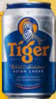
TIGER BEER 罐装啤酒 (320ml can)