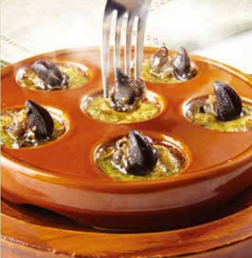
OVEN GRILLED ESCARGOTS S$5 90 nett