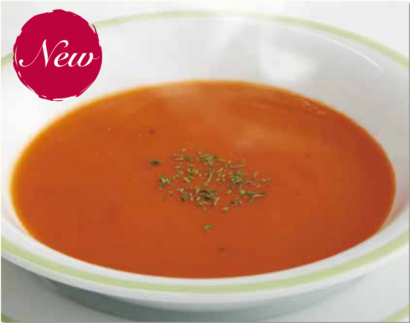
TOMATO CREAM SOUP 番茄奶油浓汤 Creamy Soup made with Tomato