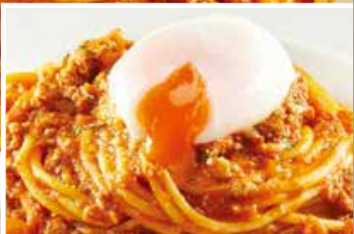
BOLOGNESE POACHED EGG 肉酱意大利面(加半生熟蛋) With Beef Bolognese Sauce and Poached Egg