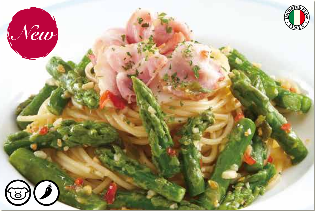
AGLIO OLIO ASPARAGUS & BACON 芦笋培根香蒜意大利面 Peperoncino Sauce with Asparagus & Bacon