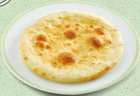
ORIGINAL FOCACCIA 披萨包