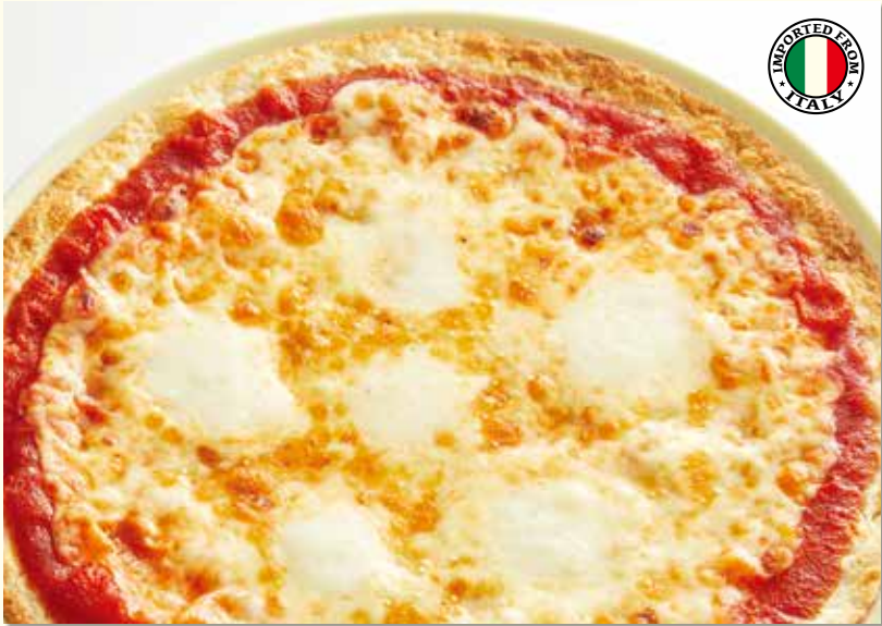
MARGHERITA 玛格丽塔披萨 Italian Buffalo Mozzarella Cheese