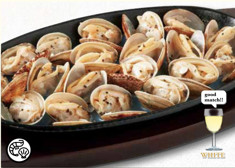
BAKED CLAMS 清香烤蛤蜊 Clam with Black Pepper