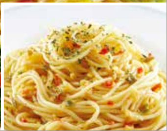
AGLIO OLIO PLAIN 香蒜意大利面 Without Shrimp and Broccoli