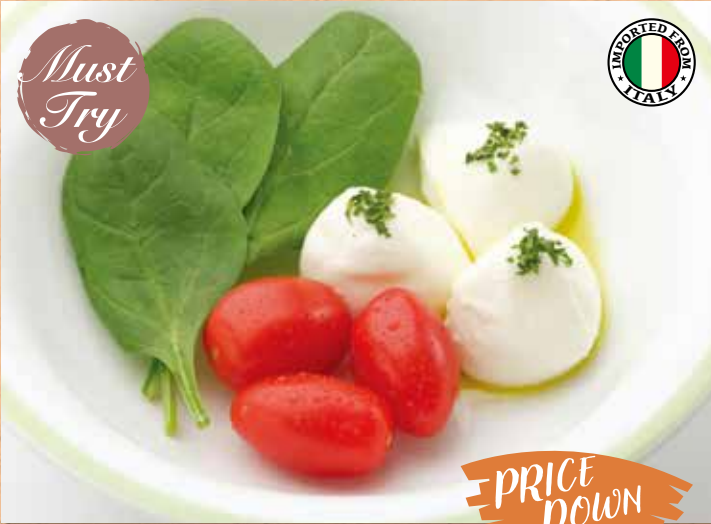
BUFFALO MOZZARELLA CHEESE 水牛芝士小番茄 Italian Mozzarella Cheese with Tomato and Baby Spinach